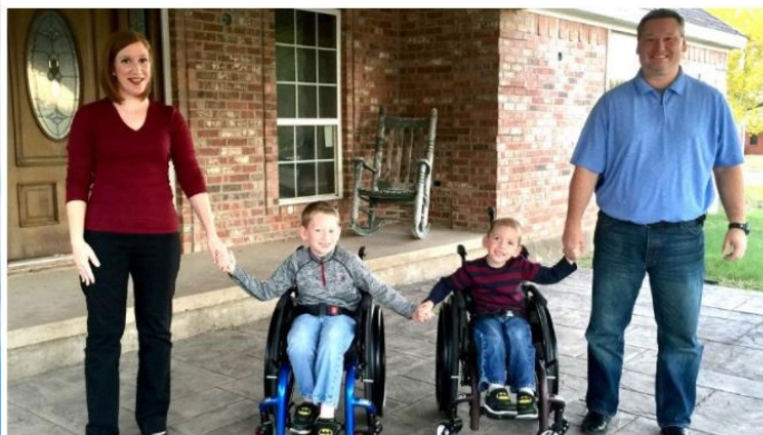
The Cops and their two sons.

"Fixer Upper" fans pay off mortgage for local couple with disabled sons